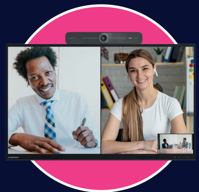
Collaborate your way