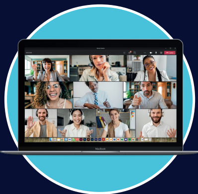
Start the meeting from your laptop