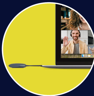
Connect CleverCast to your laptop